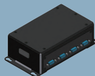
Trigger/ Encoder signal Hub